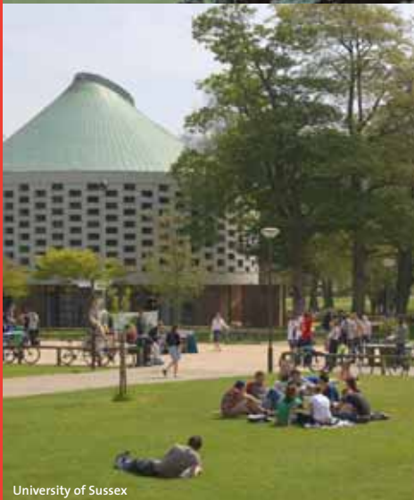
University of Sussex