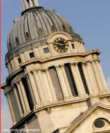
University of Greenwich