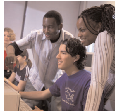
> Multimedia centre