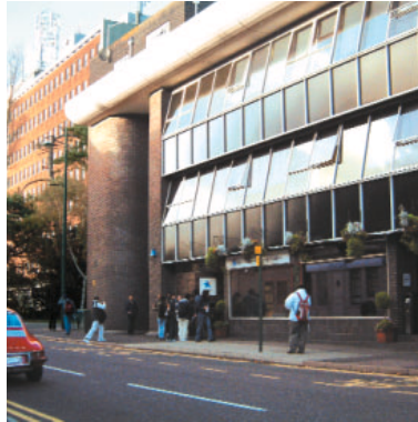
> Aspect College Bournemouth