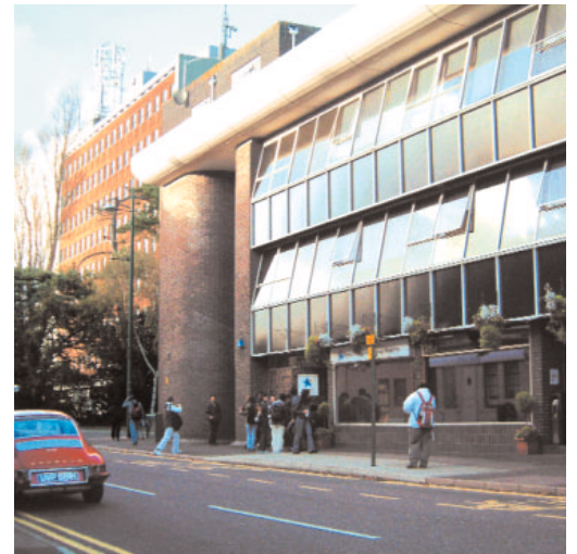
Aspect College Bournemouth