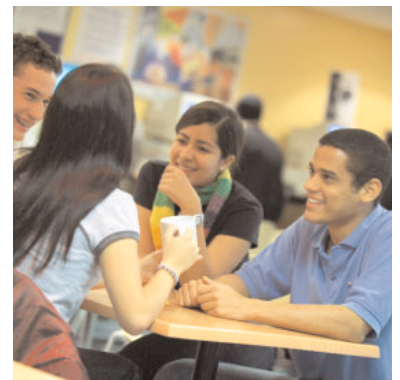
> Common room